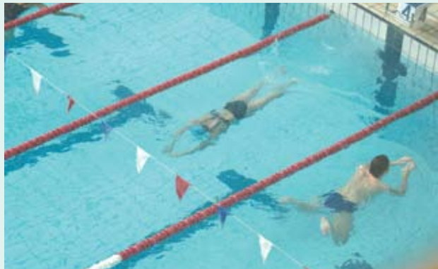
Social enterprise: Greenwich Leisure Ltd (Swiss Cottage)

Armed with these new facts about the sector, we will continue our discussions with the Ministry of Employment and the Economy in Finland and other important stakeholders on legislation and build public support for social enterprise. We will work to ensure that social enterprise is put on and remains on the public agenda both here and in Finland, and that entrepreneurs in both countries find each other.